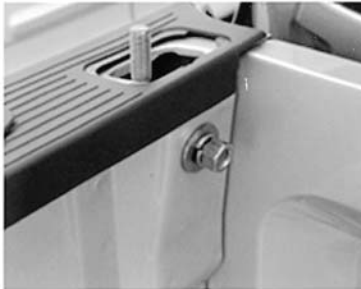
Secure with 1/2" nut