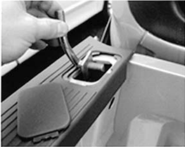
Insert bolt into pocket